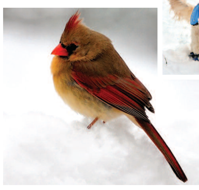
PRETTY BRRR-D • Looks like this chilly cardinal might be getting cold feet over her decision not to fly south for the winter.