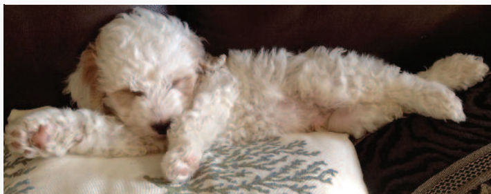
POOPED COCKAPOO ▲ New puppy Patches is truly dog-tired after playing.