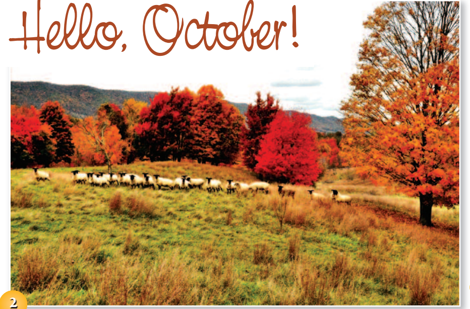
AUTUMNAL AWESOMENESS • A splash of color covers the countryside in Blue Grass. Sent by Doug Puffenbarger of Blue Grass.

We want to see your endearing, funny, or beautiful photos – shots of people (kids to grandparents), animals and beautiful scenery. Send to: Say Cheese!, P.O. Box 2340, Glen Allen, VA 23058-2340. Don't send originals; photos cannot be returned. Photos must be high resolution and printed on photo paper; or high-resolution .jpg files may be emailed to saycheese@co-opliving.com with SAY CHEESE! in the subject line. Or, share your photos with us via our Facebook page at www.facebook.com/cooperative living. Include your name , address and detailed information about the photo with all submissions.