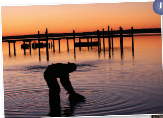
1 JAMES RIVER ◀ Sunrise provides a sublime setting for the early morning deployment of duck decoys.