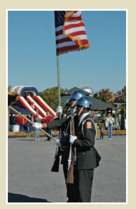
The Central High School JROTC participated in the opening ceremony at the 2011 Autumn Day festival. Visitors from throughout the state make their way to Victoria on the first Saturday of October for this event.

Victoria Town Office, also located on Main Street, is a source of visitor information and the place to set up a tour of the Victoria High School Museum, where classrooms of the old high school are set up to showcase the town's history. There are areas dedicated to local sports, the