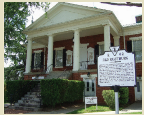
Campbell County Historic Courthouse Museum

Rustburg hosts William Campbell in the Red Devils' 2011 opener on Aug. 26, with Labor Day and another cycle of autumn activities on the way in the life of this down-home Central Virginia community. ■