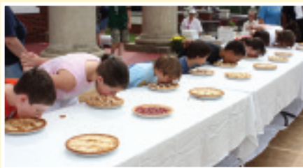
A pie-eating contest is just one of the many fun-filled festivities that take place during the annual Amelia Day celebration.