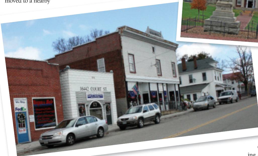
The core of the old Amelia village is home to offices, gift shops, banks, churches and other concerns. (Inset) Today's courthouse, in the village's picturesque courthouse square, was built in 1924.