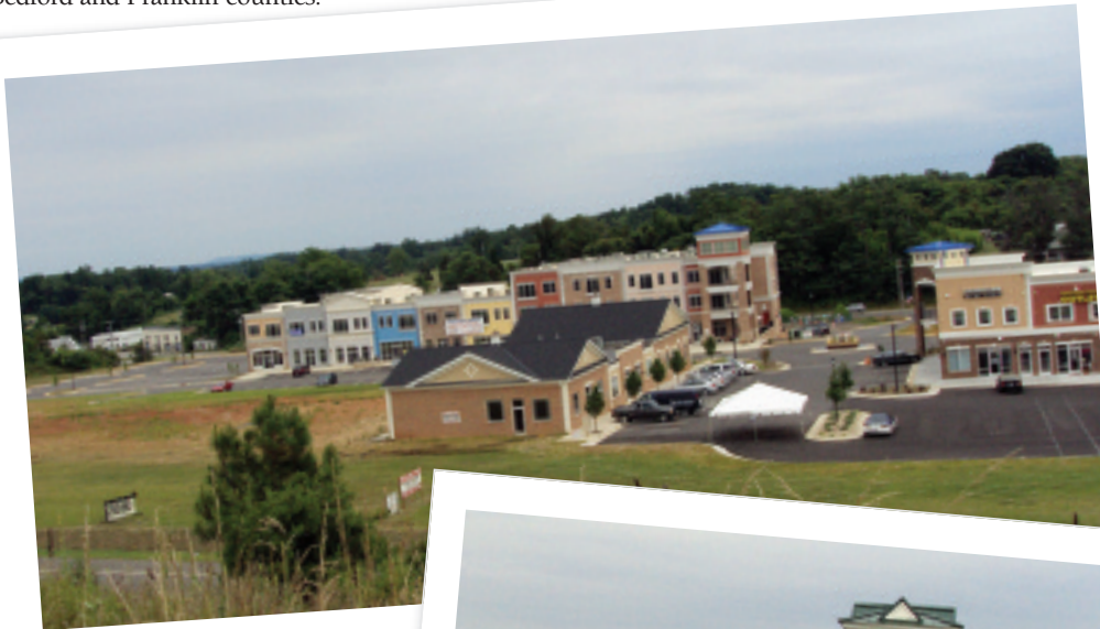
A new commercial development not far from old Moneta village (at left in top photo) combines both the Moneta and lake names — “Downtown Moneta at Smith Mountain Lake.”