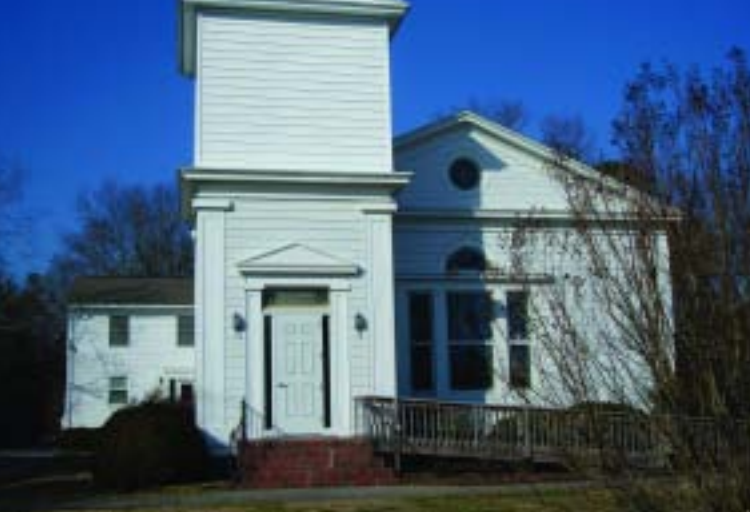
The Belle Haven Presbyterian Church (left) was founded in 1879, and the Belle Haven United Methodist Church (above) followed seven years later. Methodist clergy were not well received in Belle Haven until the late 1800s when a church finally took root. In fact, some Methodists considered Belle Haven one of the most "ungodly" places on the Shore.