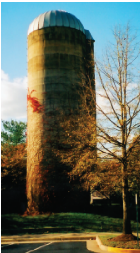
A silo still stands in the middle of an apartment complex as a reminder of Centreville's recent past as farmland.

If you are planning to stay overnight, there are many motels and hotels in the Chantilly and Dulles area, including the Westfields Marriott in the Westfields Corporate Center on Route 29. Economy-minded travelers may wish to consider accommodations in the Manassas area, which boasts a number of the less expensive national-chain motels. ■