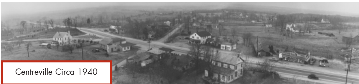
Centreville Circa 1940

than 500 in the 1940s, his Western Fairfax district is now home to over 150,000 people – a 63 percent increase in population in the past 10 years.