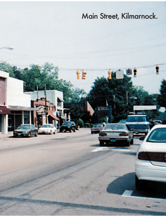
Main Street, Kilmarnock.

than its Scottish counterpart, features an authentic pub, complete with British food, a wide selection of British beer, musical entertainment and an English dart board. The town even has its own bagpipe band. The Kilmarnock Museum has an exhibit of Scottish memorabilia direct from Kilmarnock, Scotland.