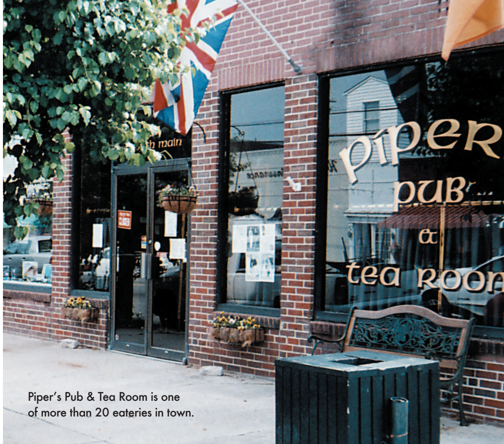
Piper's Pub & Tea Room is one of more than 20 eateries in town.

Kilmarnock is located in an area known as the "Land of Pleasant Living," Virginia's historic Northern Neck. The Northern