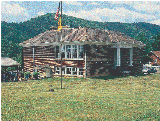
Down Home Bed and Breakfast (top) on Rt. 311 offers respite to weary travelers in an area void of commercialism. Catawba Hospital (center) is the area's major employer. The Catawba Community Center (bottom) serves as a meeting place for civic groups.

The church reportedly began in 1780 somewhere along the creek.