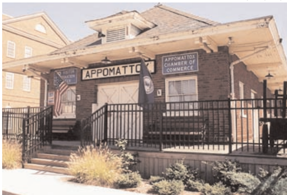
The Appomattox Visitor Information Center, located on Main Street in a restored railroad depot, is the first and best place to begin touring the town and county.

The old village, or “surrender grounds,” as it is known by the native population, was abandoned in 1892, when a fire destroyed the old courthouse. A new courthouse was promptly built four miles west of the old village, next to the new railroad line. The town quickly grew around it and it is in this “new” Appomattox that many guests begin their visit.