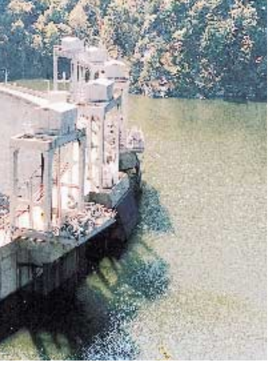
The Visitor's Center at the Smith Mountain Dam offers a slide show detailing the construction and operation of the dam, a three-dimensional terrain map, and a spectacular overlook of the dam, lake and mountain.

senger railroad in 1909 and began to flourish.