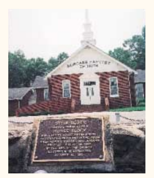
The oldest church in the area, Morgan's Baptist Church was established in 1771.