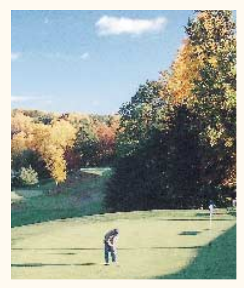
Five major golf courses are located in the Smith Mountain Lake area.

For information on any/all of these events, activities or overnight accommodations, contact the Smith Mountain Lake Chamber of Commerce/Partnership at 1-800-676-8203. ■