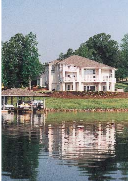
The Smith Mountain Lake Charity Home Tour has drawn as many as 3,000 visitors in one year to see 10 grand and beautiful homes on the lake. This year's home tour will be October 6-8.

Bordering three counties — Pittsylvania, Franklin and Bedford — the lake began to grow slowly at first as local area residents