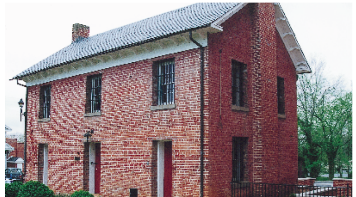
(Top) The stately Louisa County Courthouse, a Virginia Historic Landmark, overlooks Main Street. (Above) The former Louisa County Jail, built in 1868 on Courthouse Square, now serves as the Louisa County Historical Society Museum.

a hospital following the Battle of Trevilians, considered the largest all-cavalry battle during the Civil War. The Battle of Trevilians was fought at several locations just a few miles west and north of the Town of Louisa on June 11 and 12, 1864. The battle occurred when General Phillip Sheridan attempted a raid on the Virginia Central Railroad as a strategy to break General Robert E. Lee's vital supply line from the Shenandoah Valley. About 13,000 caval-rymen were involved in the battle, and 1,619 were either killed or injured.