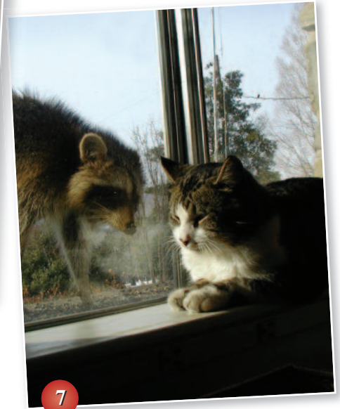
7 BLIND MAN'S BLUFF ▶ Raccoon? What raccoon? Pepper coolly ignores a would-be masked intruder. Contributed by reader Dot Stewart of Purcellville.