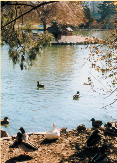
Gypsy Hill Park

On New Street, one block off Beverly, is the Blackfriars Playhouse , where audiences can experience Shakespearean plays as they were originally presented with all the lights on throughout the theater, sparse sets, and actors playing several roles and even switching genders. "We make the theater a