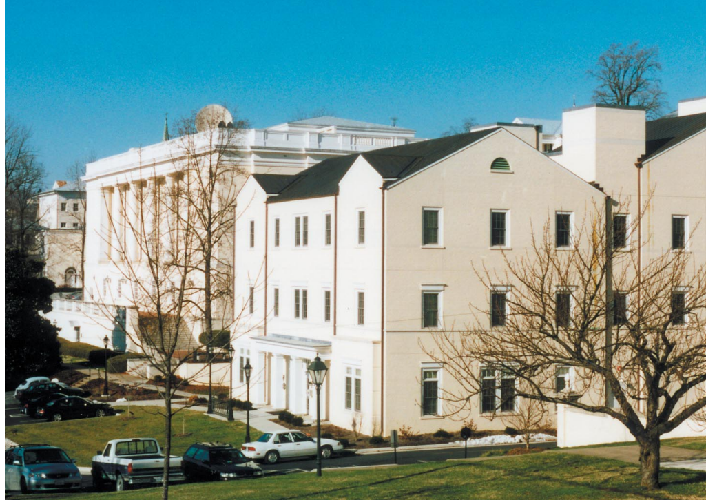
Among the city's notable structures is the birthplace of President Woodrow Wilson on Coalter Street (left). Mary Baldwin College, established in 1842 as the Augusta Female Seminary, is on the city's walking tour.