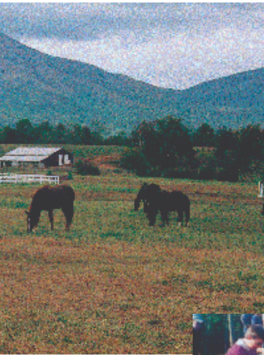
The majestic Peaks of Otter provide the backdrop for wide expanses of farmland in Bedford County.

home to the National D-Day Memorial. Bedford was selected for this honor, and the majestic monument constructed to commemorate it, because the region lost 19 soldiers the first day of the D-Day assault in World War II. This was the highest per-capita loss of life