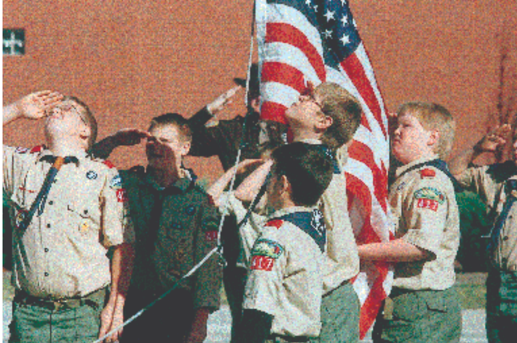
Patriotism and national pride abound in Bedford. (Inset) Civic-minded residents pitch in to bag potatoes for the needy.