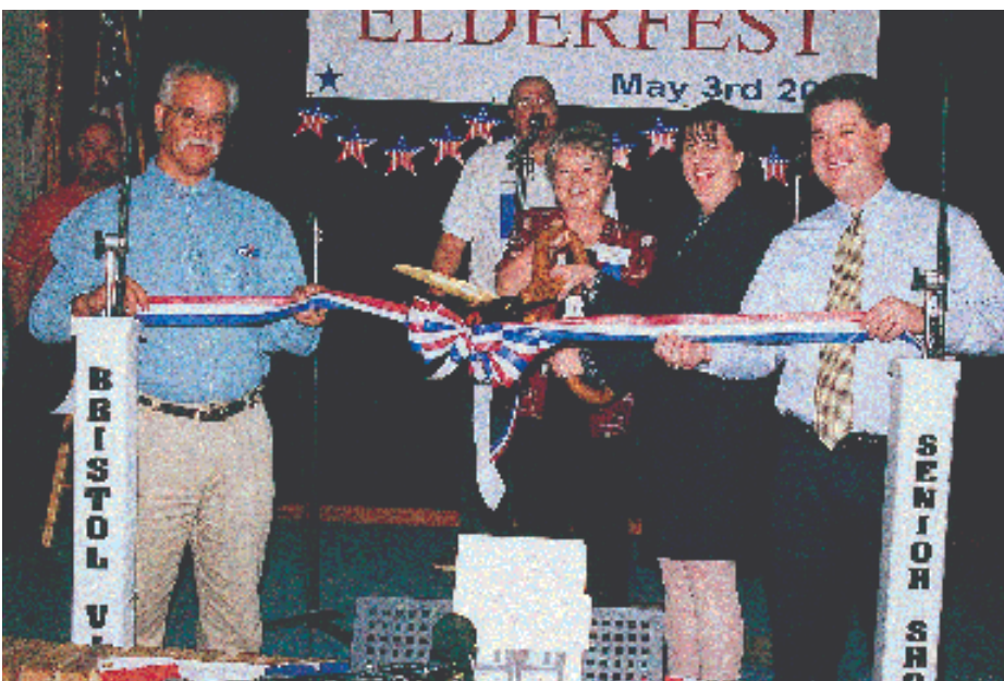
Bedford-area officials open the annual Elderfest, an event for active senior citizens in the community. At right is The Cedars, one of many restored homes in Bedford County.