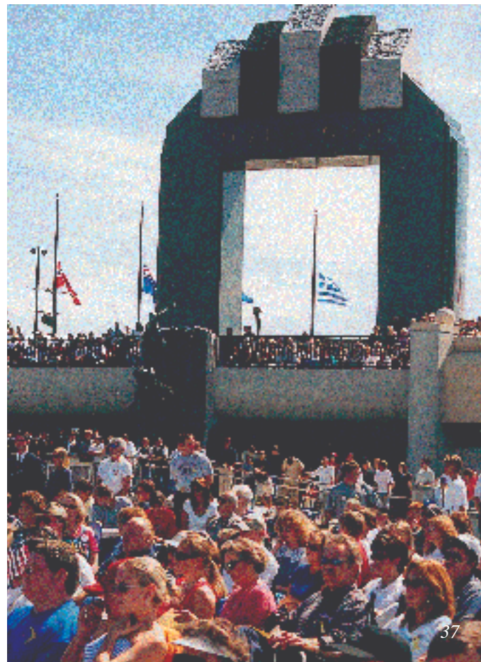
Crowds gathered on June 6, 2001, for the dedication of the National D-Day Memorial.

Overlord Arch greets each visitor as an impressive, 44-foot structure with a polished, green granite façade that bears the word "Overlord," the code name of the Normandy landing. Below the arch, a featured piece of statuary called Final Tribute stands as an acknowledgement of the sacrifices made during the assault.