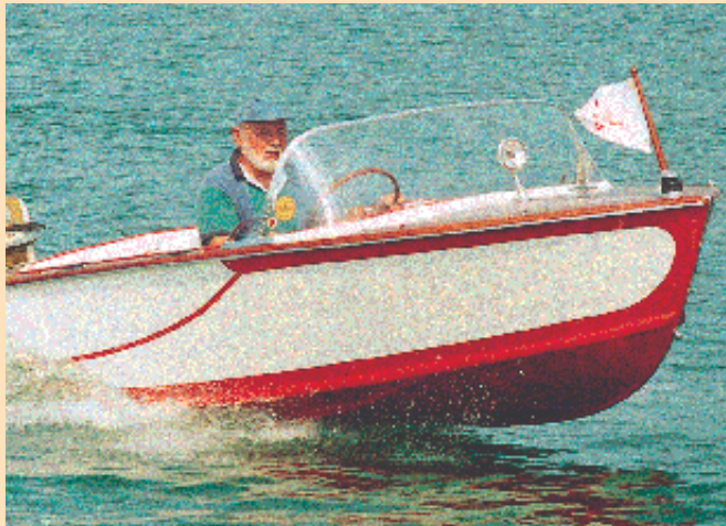
Antique Boat Show at popular Smith Mountain Lake.

Poplar Forest, Bedford County home of third U.S. President Thomas Jefferson, offers